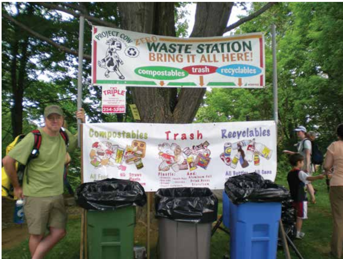
Strolling of the Heifers Expo, Brattleboro, Vermont. Windham County Solid Waste District provides composting, recycling, and trash collection stations.