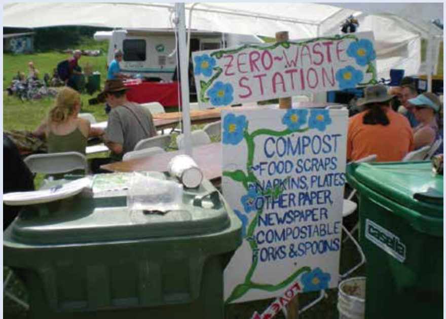
SolarFest, Tinmouth, Vermont

An estimated 1,400 pounds of food waste, soiled paper and compostable service ware was collected for composting, along with 780 pounds of recyclables, during the 2009 event. Trash cans were limited to the portable toilet areas. Compostable materials were hauled by the Rutland County Solid Waste District staff to their compost site. The event continues to be zero waste.