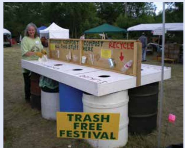
Garlic and Arts Festival, Orange, Massachusetts

In 2011, 115 bags of compostable material was collected from the event, weighing approximately a ton.