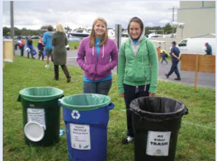
Coast Day, Lewes, Delaware

Five green stations were set-up around the main food vendor area and the cook-off tents. High school students and University Green Team members monitored the stations throughout the day. Full bags of compost, recyclables, and trash were collected by the University crew and compostables were hauled to Blue Hen Compost Facility for processing.