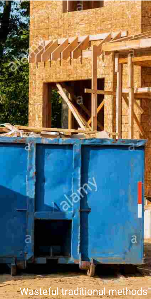
Wasteful traditional methods