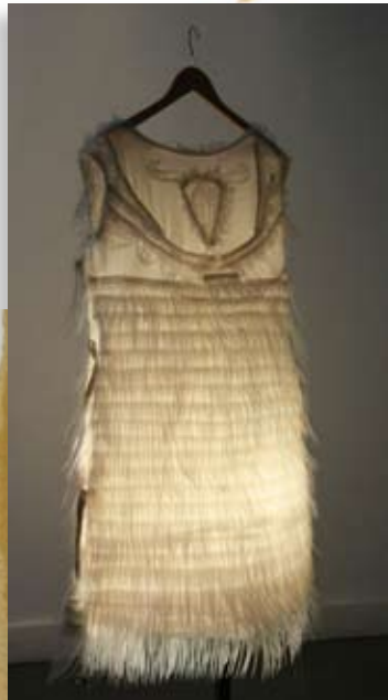
An art piece commissioned for Waste Reduction Week, made of recycled milk jugs.