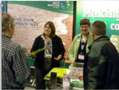
Left: At the SUMA conference.