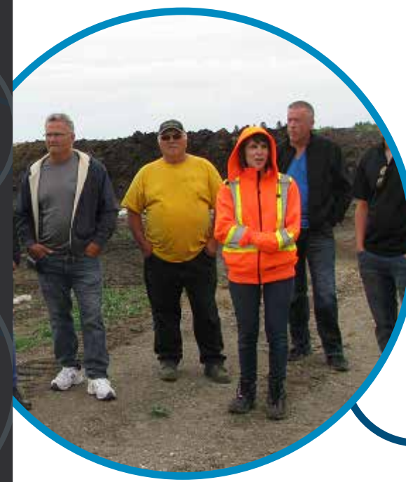
Pictured: Participants tour the Yorkton compost site.

SWRC's annual Compost Field Day was held on May 29th at the Gallagher Center in Yorkton with 19 people participating. Presentation topics included basic composting, how compost affects soil health, regulations for operating compost facilities, and the city of Yorkton's compost program. Participants also toured the Yorkton compost site.