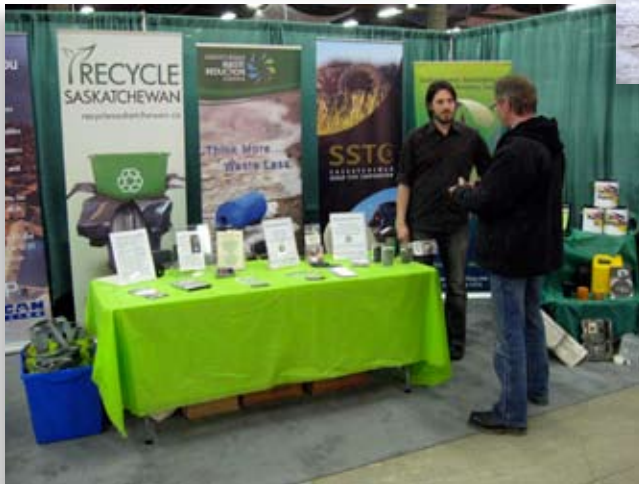
Below: The Regina Home Show.