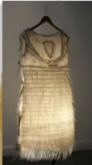
An art piece commissioned for Waste Reduction Week, made of recycled milk jugs.