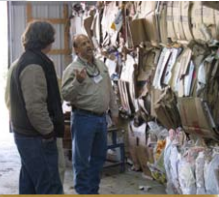
Above: Touring Futuristic Industries in Humboldt at the Fall Forum.