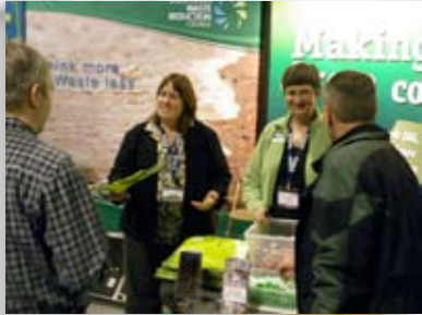
Left: At the SUMA conference.